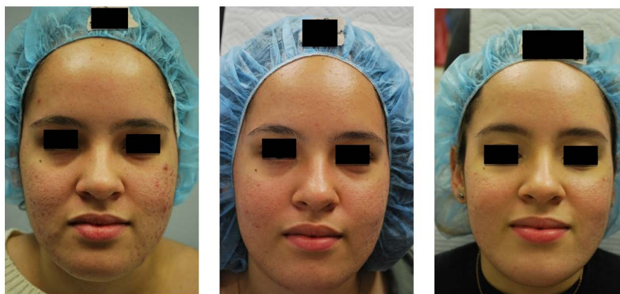
Figure 3. Acne, acne scarring and pores before (left), 1 month post 4 treatments (middle) and 13 months post 6 treatments (right).