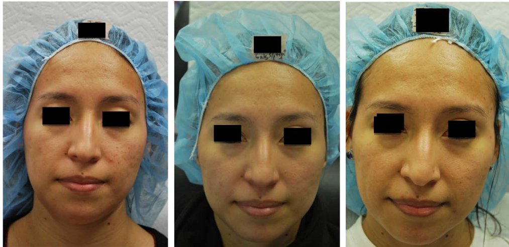
Figure 1. Scarring acne and acne scars before (left), 6 weeks post 4 treatments (middle), and 2 years post 4 treatments (right).

It should be noted that one more patient who was followed two years after last treatment demonstrated impressive results (not yet photographed at the clinic).